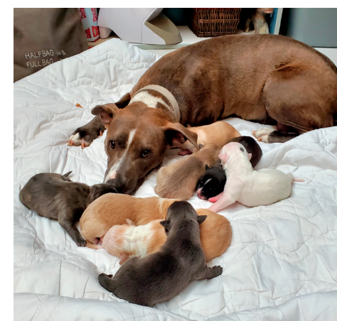
Lulu and her newborn puppies

eight spunky puppies. She fit right in at her foster home and was showered with love, but she was ready to return home to her owner when her maternal duties came to an end and her puppies no longer needed her. Lulu's puppies were quickly adopted and are now in loving forever homes.