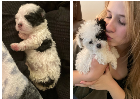
Patches survived thanks to her amazing foster family!