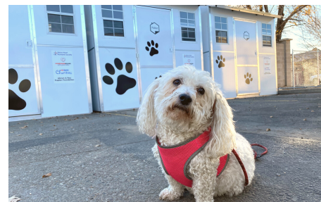
Roice-Hurst foster dog Ginger poses in front of the Homeward Hounds shelters.

This first-of-its-kind project ensures people don't have to choose between avoiding extreme temperatures and dangerous situations on the streets or keeping their beloved companion animals. Now people have an option to keep themselves and their pets safe.