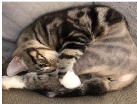
Stripes is healing from his major leg surgery in his foster home.