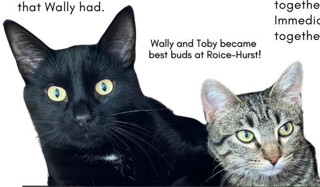
Wally and Toby became best buds at Roice-Hurst!

Just one day later , a family came looking to adopt a cat. After witnessing the special bond between Wally and Toby, they knew they had to welcome both to the family! Their sweet bond continues to grow in their new home.