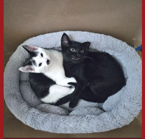
FLIP-FLOP AT THE GALA • FLIP-FLOP AND CHARLIE • CUDDLE BUDDIES

Vet care is expensive – whether a pet has a neurological condition like me, broken bones, parvovirus, dental issues, kidney disease, or cancer. These veterinary costs are covered for shelter pets by compassionate animal lovers within our community through a special fund at Roice-Hurst called Jake's Fund for Pets with Extraordinary Medical Needs.