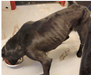
Draco arrived at Roice-Hurst as a malnourished stray.