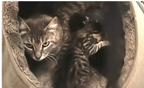
Temple snuggled up with her babies in foster care.

After the family was discovered, Temple and her kittens moved into a more suitable home with a loving foster family, despite Temple's hissy attitude.