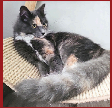
MY ARRIVAL AT RHHS